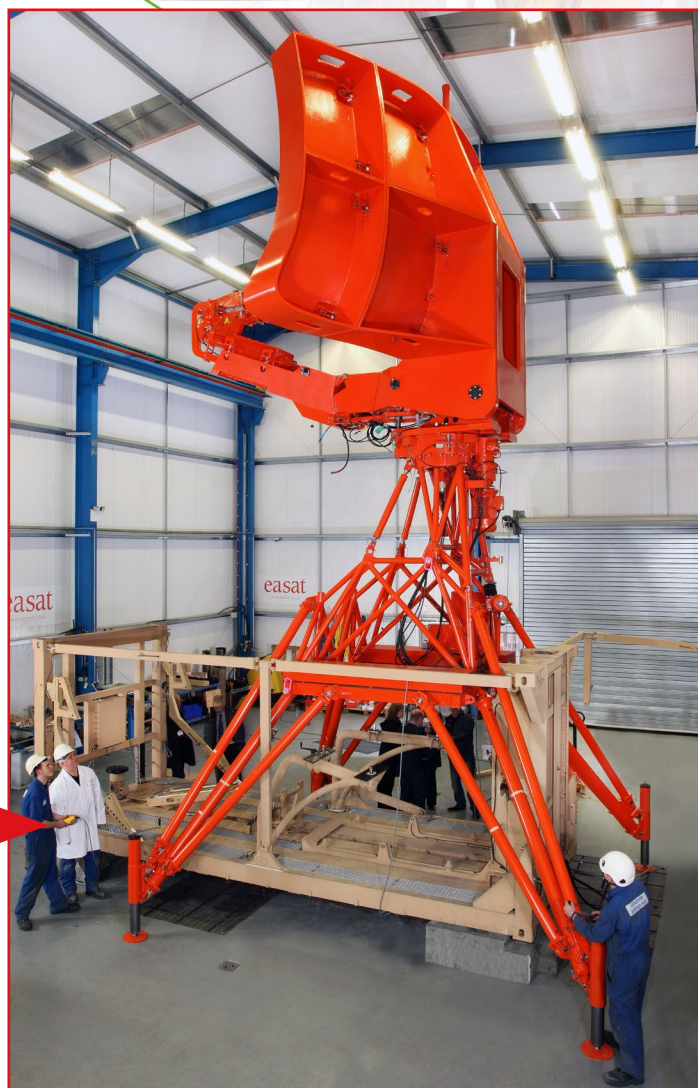
Easat Transportable ATC Radar shown in stowed / palletised configuration and in fully deployed configuration